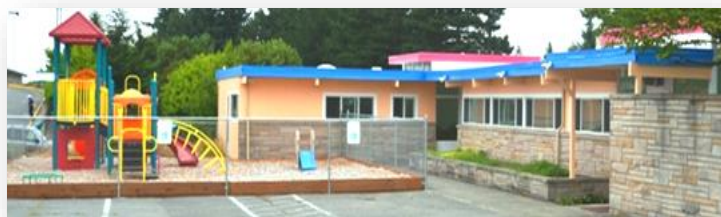
2). 1201 N 145 th St. Seattle