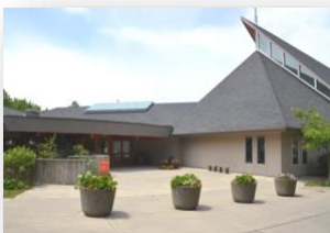
1). 4228 Factoria Blvd SE Bellevue